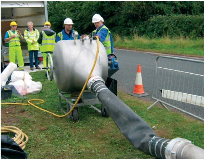
Inversion drum preparation

T he Aqualiner process is different from traditional 'Cured in Place Pipeline' (CIPP) systems as it does not use chemical based liquid resins such as polyester, epoxy or polyurethane's. An integral part of the Aqualiner material is a thermoplastic fibre which makes up around 50% of the composite. The material that arrives on site for installation contains both glass fibres, for stiffness and strength, and thermoplastic polymer fibres that becomes the matrix that surrounds the reinforcing fibres after processing. This means that there is effectively no shelf life on the material and few concerns about toxicity.