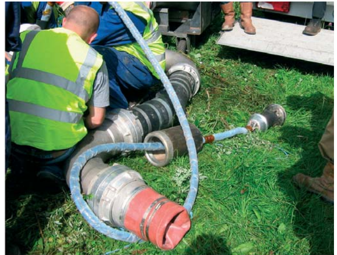
Inversion bag and heater pig