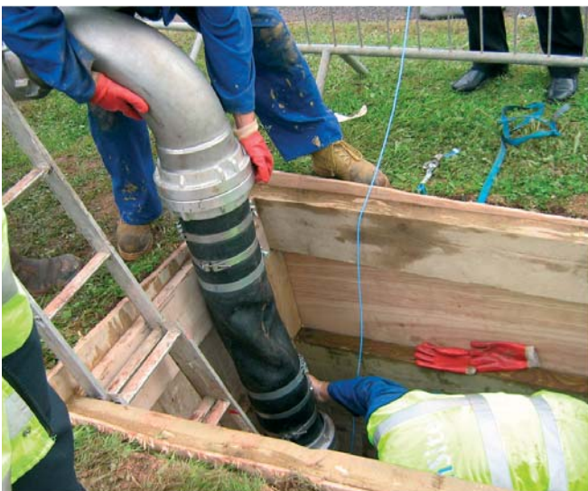
Inversion into sewer